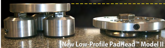
New Low-Profile PadHead™ Model II

Versatile. Revolutionary. The only head on the market using The Resistance of Friction principle.