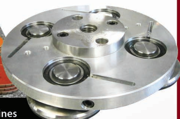
Model II as applied on a Patch Kit & for flat polishing machines