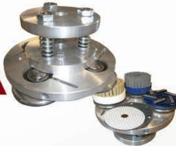
Model C for CNC machines